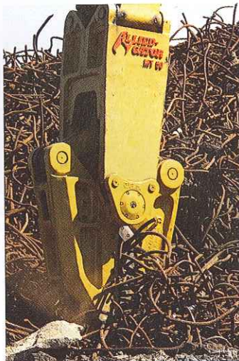
MTR 50 S – Rebar Processing.