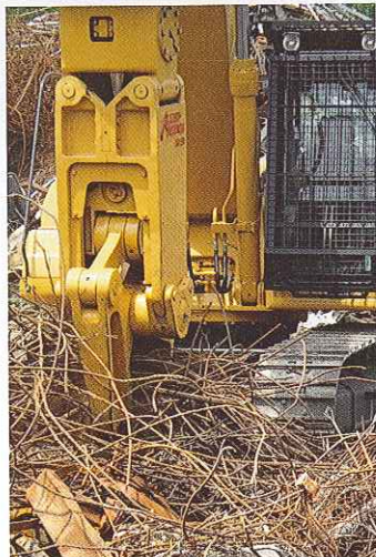
MTR 50 S – Wire Processing.