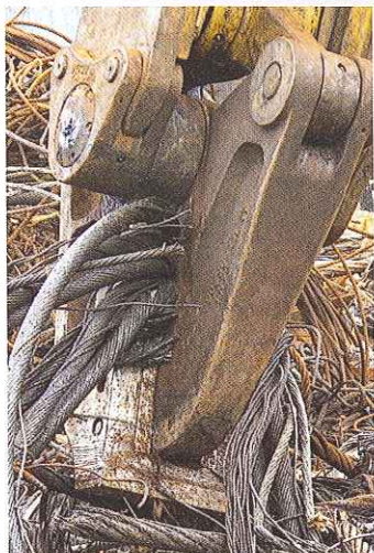
MTR 50 S – Cable Processing.