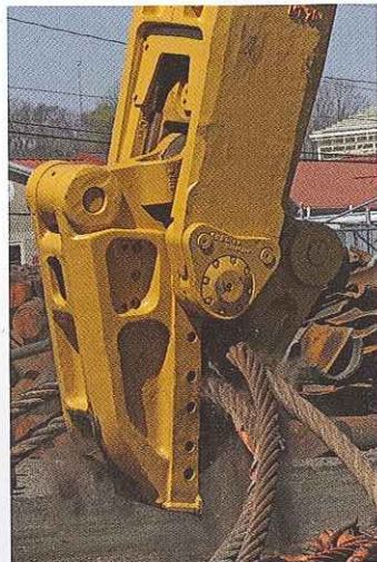
MTR 70 S – Drag Line Cable Processing.